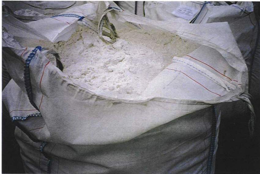
Centrifuged Potato Starch @ 62% DS Recovered from Potato Processing Factory