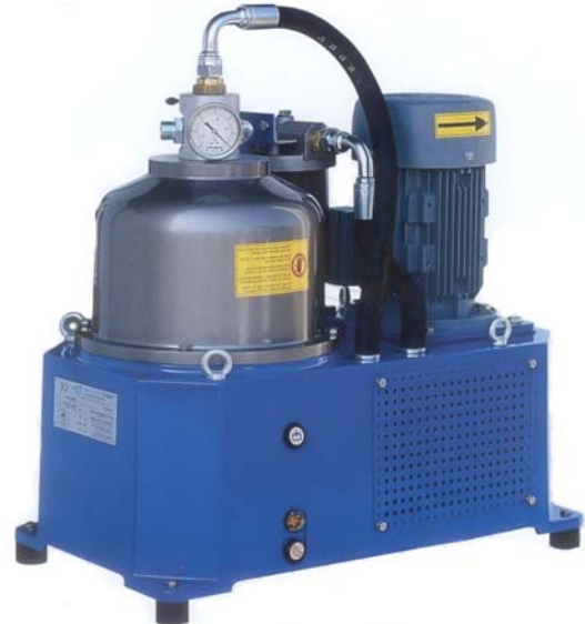
MODEL MAC 250 BD M