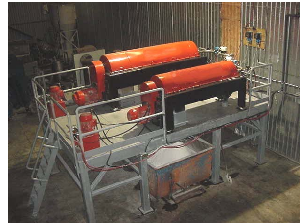
Typical mixed waste stream and starch recovery installation shown above

An industry of satisfied customers Proven results to support 100% money back process guarantee